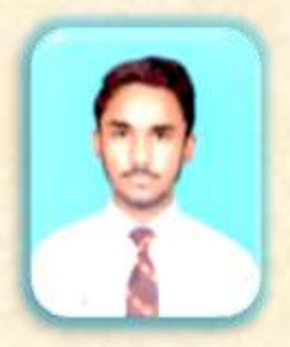
Secured 100% in Computer Science