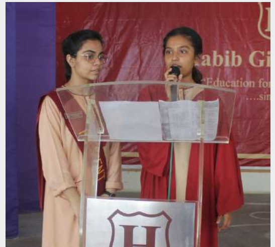
Celebrating Teacher's Day