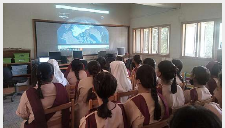
World Space Week 2022 celebrations on the theme "Space and Sustainability"