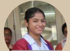
BEST PLAYER OF VOLLEYBALL