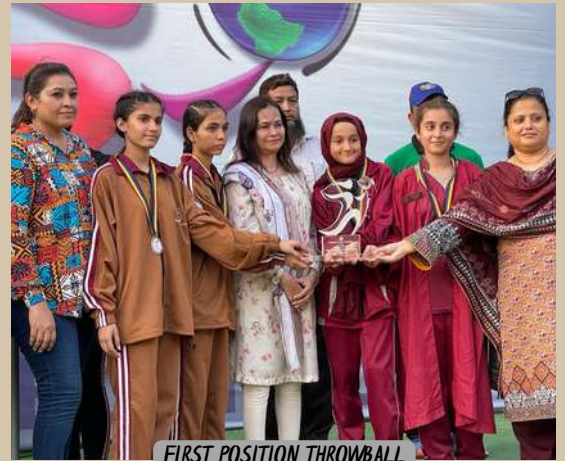
FIRST POSITION THROWBALL