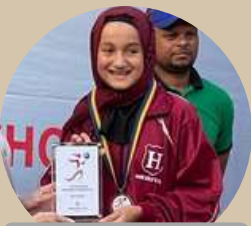
BEST PLAYER OF TABLE TENNIS

We are proud to announce that HGS Table Tennis team won the first position amongst 7 teams at the DPS Inter School Tournament.