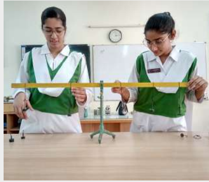
Hands on science investigations