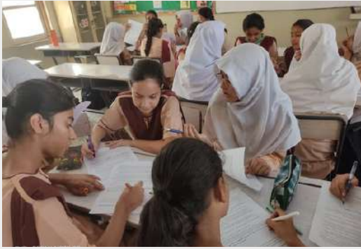
Collaborative work in English classroom