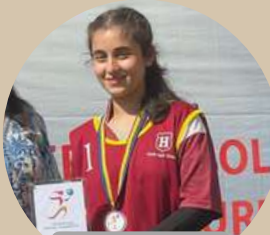
BEST PLAYER OF THROWBALL