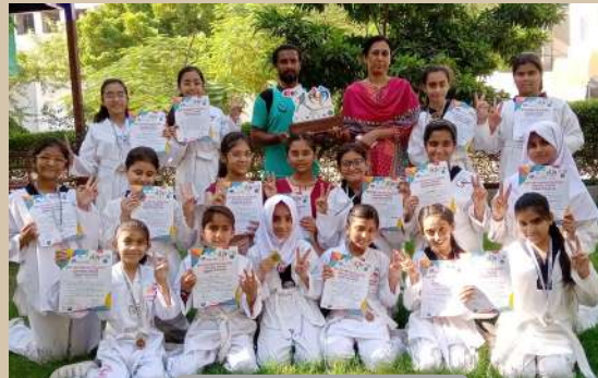
FIRST POSITION TAEKWONDO