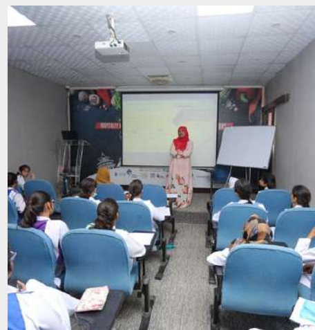
Visit to COTHM Karachi, College of Tourism and Hotel Management (COTHM)-Grade X (Food and Nutrition Group)