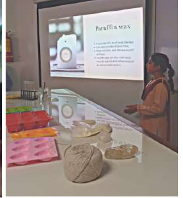
Shared learning experience with young entrepreneurs from Alpha Core School