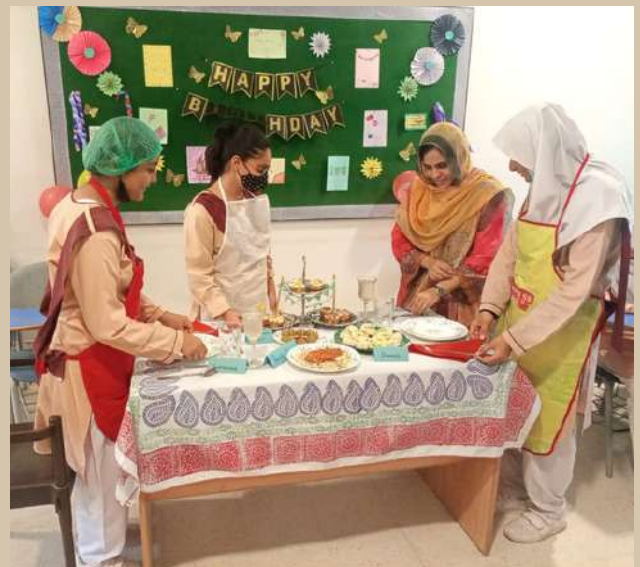
Practical learning experience for Food sciences