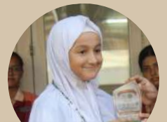
BEST PLAYER OF TABLE TENNIS