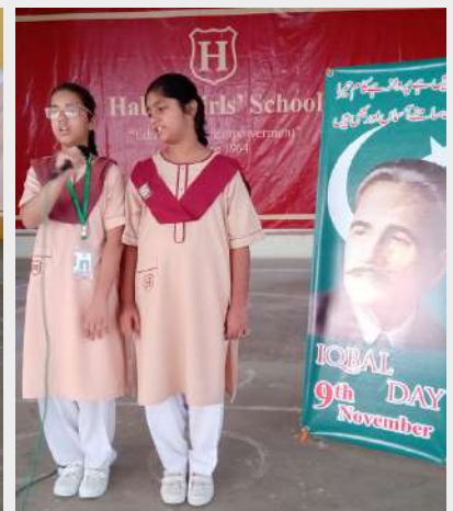
Week-full of activities for celebrating Iqbal day