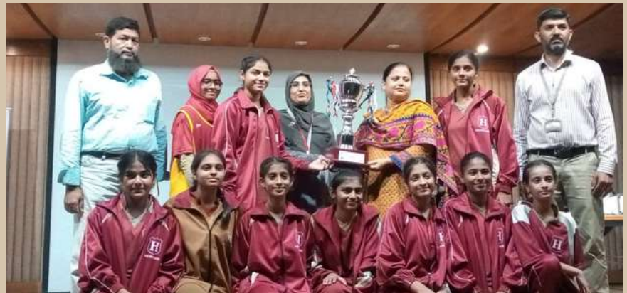
FIRST POSITION THROWBALL

HGS Throwball team won the first position in the 6th Abdul Sattar Edhi Sports Festival hosted by Generation's School.