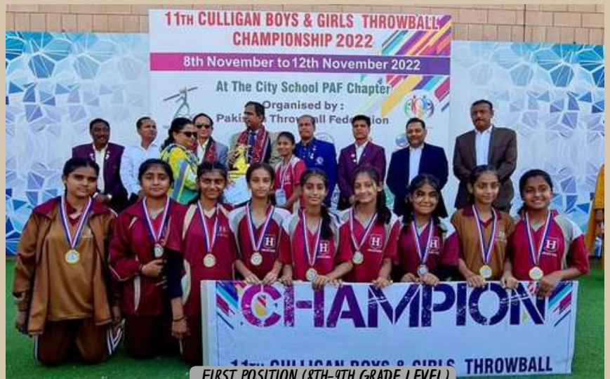
FIRST POSITION (8TH-9TH GRADE LEVEL)