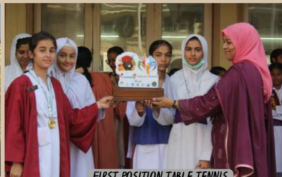
FIRST POSITION TABLE TENNIS