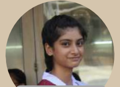
BEST PLAYER OF NETBALL