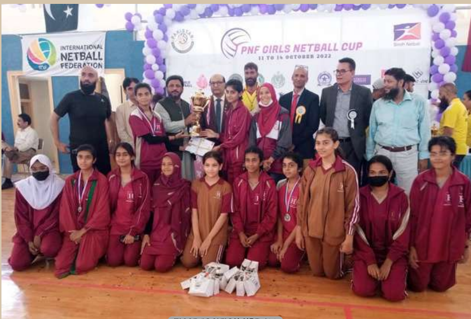
FIRST POSITION NETBALL

Sindh Netball Association and Pakistan Netball Federation organized PNF Girls Netball Cup 2022. HGS bagged the first position in the Under 15 category and Under 13 category.