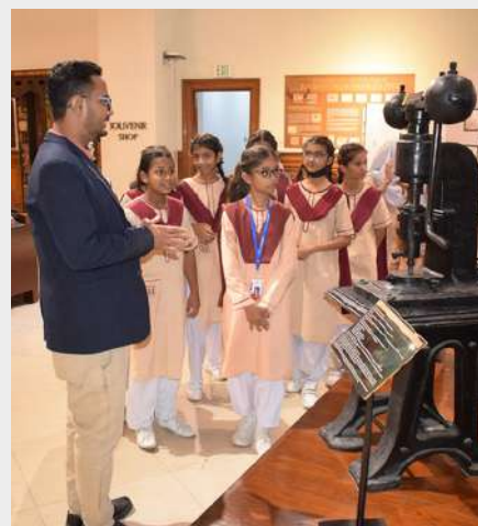
Visit to the State Bank of Pakistan's Money Museum- Grade VII and Grade X (Commerce Group)