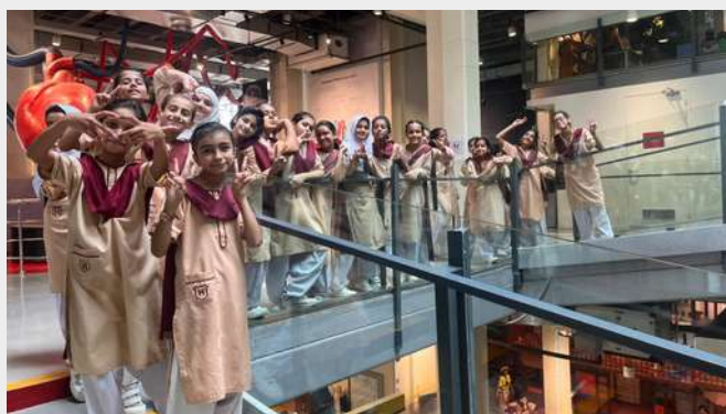
Visit to TDF MagnifiScience- Grade VI