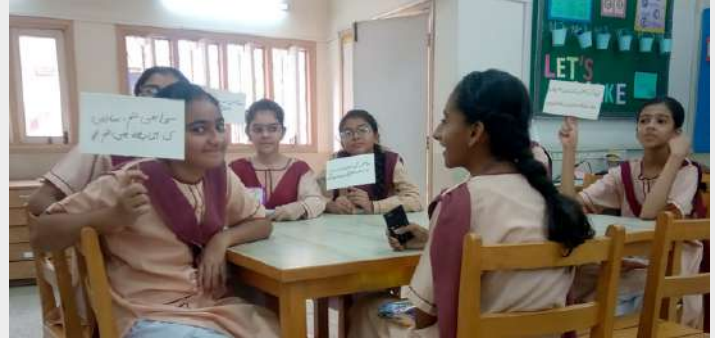
Argumentative discussion in Urdu classroom on advantages and disadvantages of science experiments