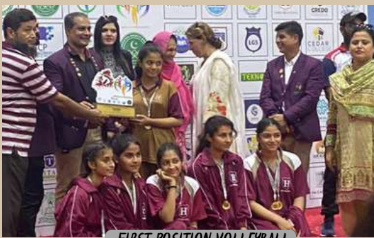
FIRST POSITION VOLLEYBALL