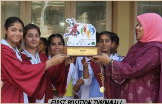
FIRST POSITION THROWBALL

HGS secured the first position in Throwball, Volleyball, Taekwondo, and Table Tennis and second position in Netball.