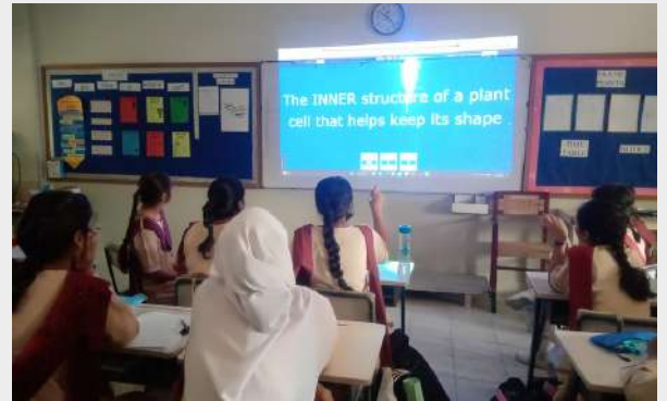
Gamified learning for reviewing science concepts