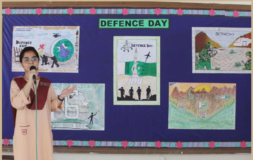
Paying Tribute to our Brave Soldiers on Defence Day