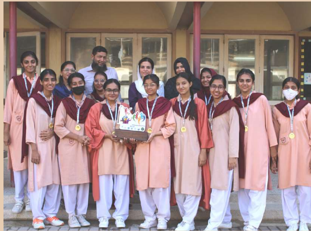
NETBALL WINNERS IN 6TH OLYMPIC TOURNAMENT

The Higher Secondary teams took part in 6th Olympic Tournament and Dawood Public School's 7th Annual Inter-school Sports Competition.