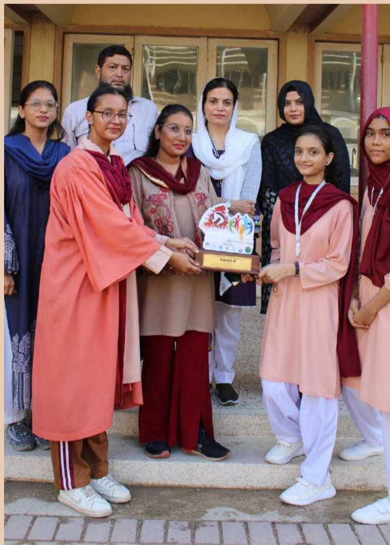
TABLE TENNIS RUNNERS UP IN 6TH OLYMPIC TOURNAMENT AND DAWOOD PUBLIC SCHOOL 7TH ANNUAL INTER- SCHOOL SPORTS COMPETITION

The Higher Secondary teams took part in 6th Olympic Tournament and Dawood Public School's 7th Annual Inter-school Sports Competition.