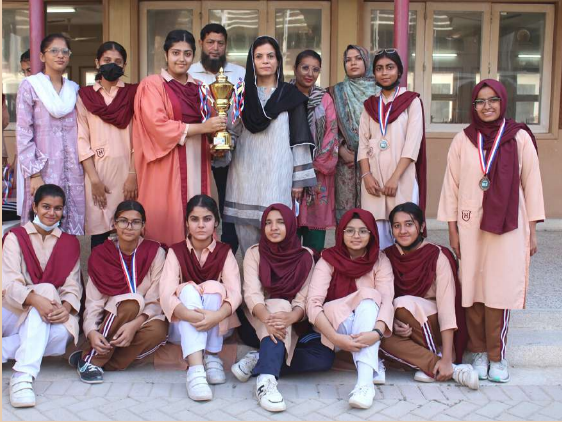
2ND POSITION UNDER-17 CATEGORY

Higher Secondary Section participated in Pakistan Netball Federation (PNF). Five players were awarded best players of the tournament.