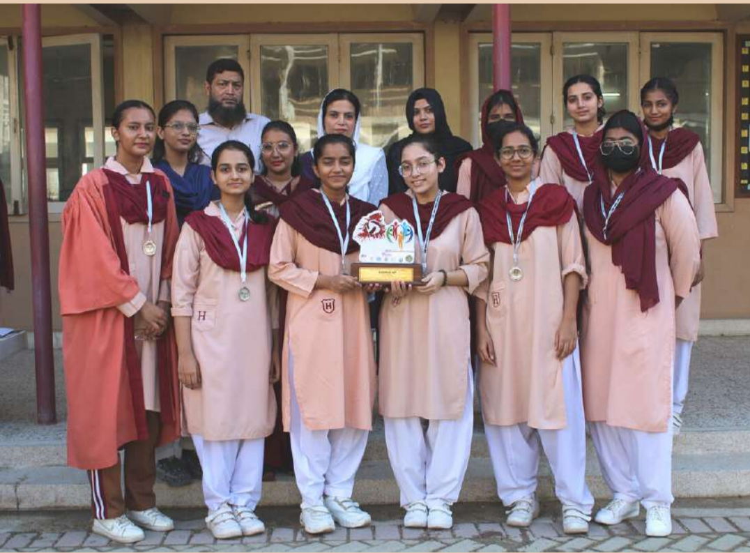
VOLLEYBALL RUNNERS UP IN 6TH OLYMPIC TOURNAMENT